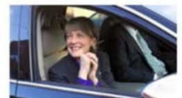
Democrats Fight to Keep Kennedy Seat