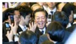
Japan Probe Burdens Ruling Party