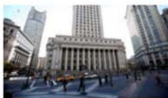
Law Firms Expect Uptick in 2010