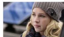
The CW's Indie Experiment