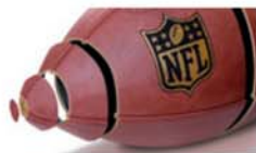
11 Minutes of NFL Action